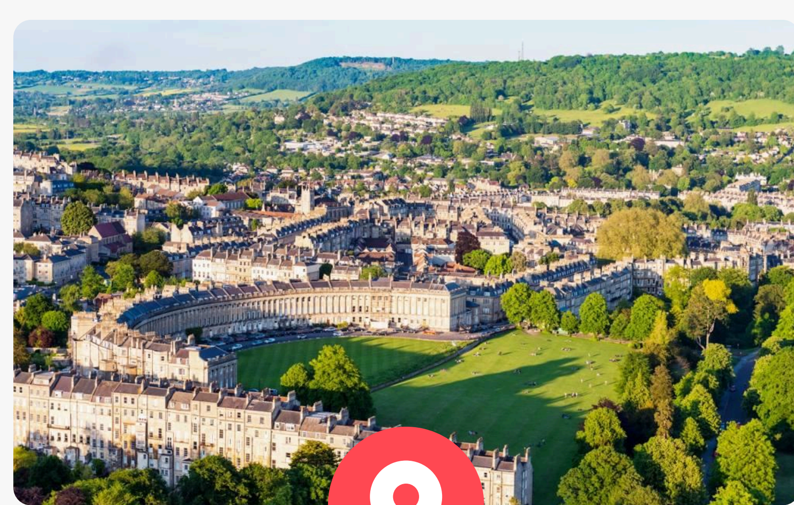
Bath, United Kingdom