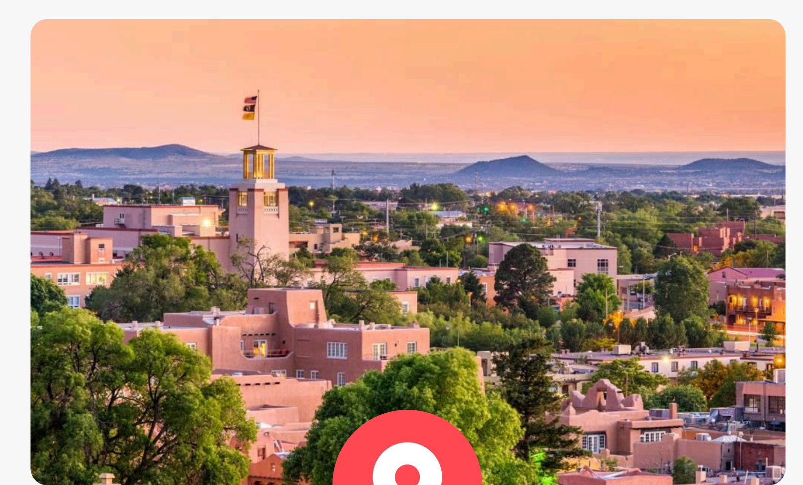
Santa Fe, USA